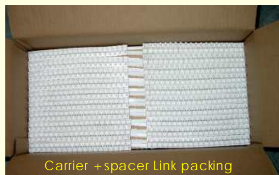
Carrier + spacer Link packing