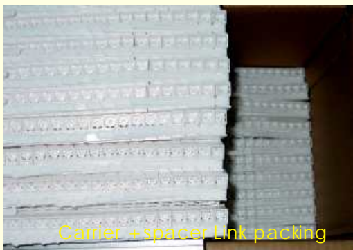
Carrier + spacer Link packing

W28-17-7P-89 Ceiling Inst. Bracket, W28-17-7Z-89 With screw, 2 holes, For 89mm system Painted, Plated, W= 2.0mm 400pcs/ctn